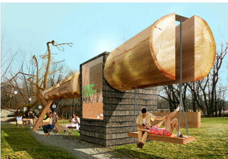
visiondivision, rendering of Chop Stick , 2012.