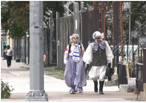
Aziz + Cucher, By Aporia, Pure and Simple , 2011. Multi-channel video, sound.