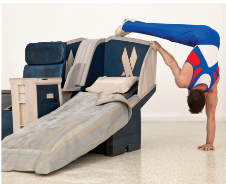
Allora & Calzadilla, Body in Flight (American) , 2011.