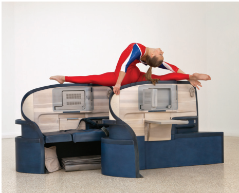
Allora & Calzadilla, Body in Flight (Delta) , 2011.